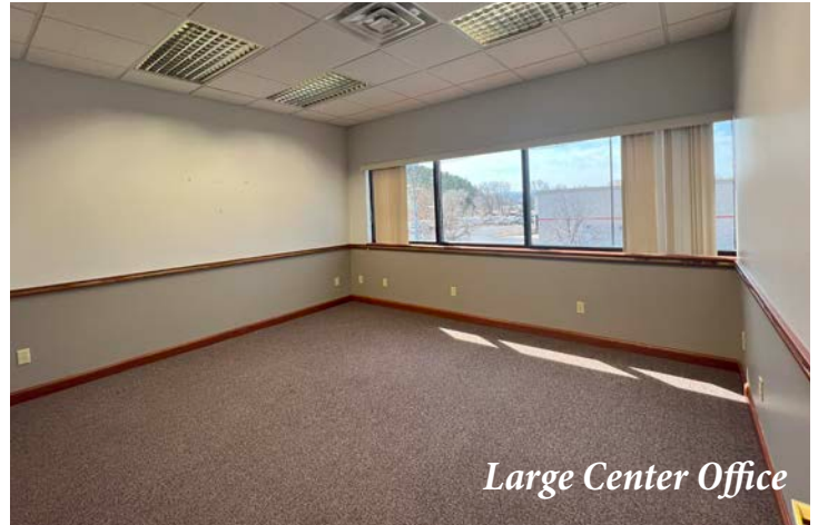
Large Center Office