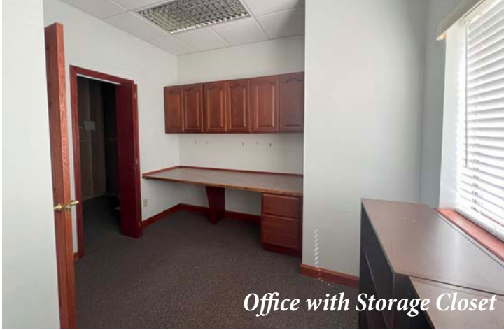
Office with Storage Closet