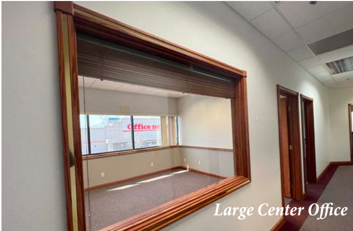
Large Center Office